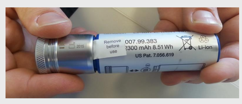
Remove battery completely from handle.

Separate bottom cap from battery by holding both and snapping them apart (force in direction of the arrows). Do not pull for the initial separation.